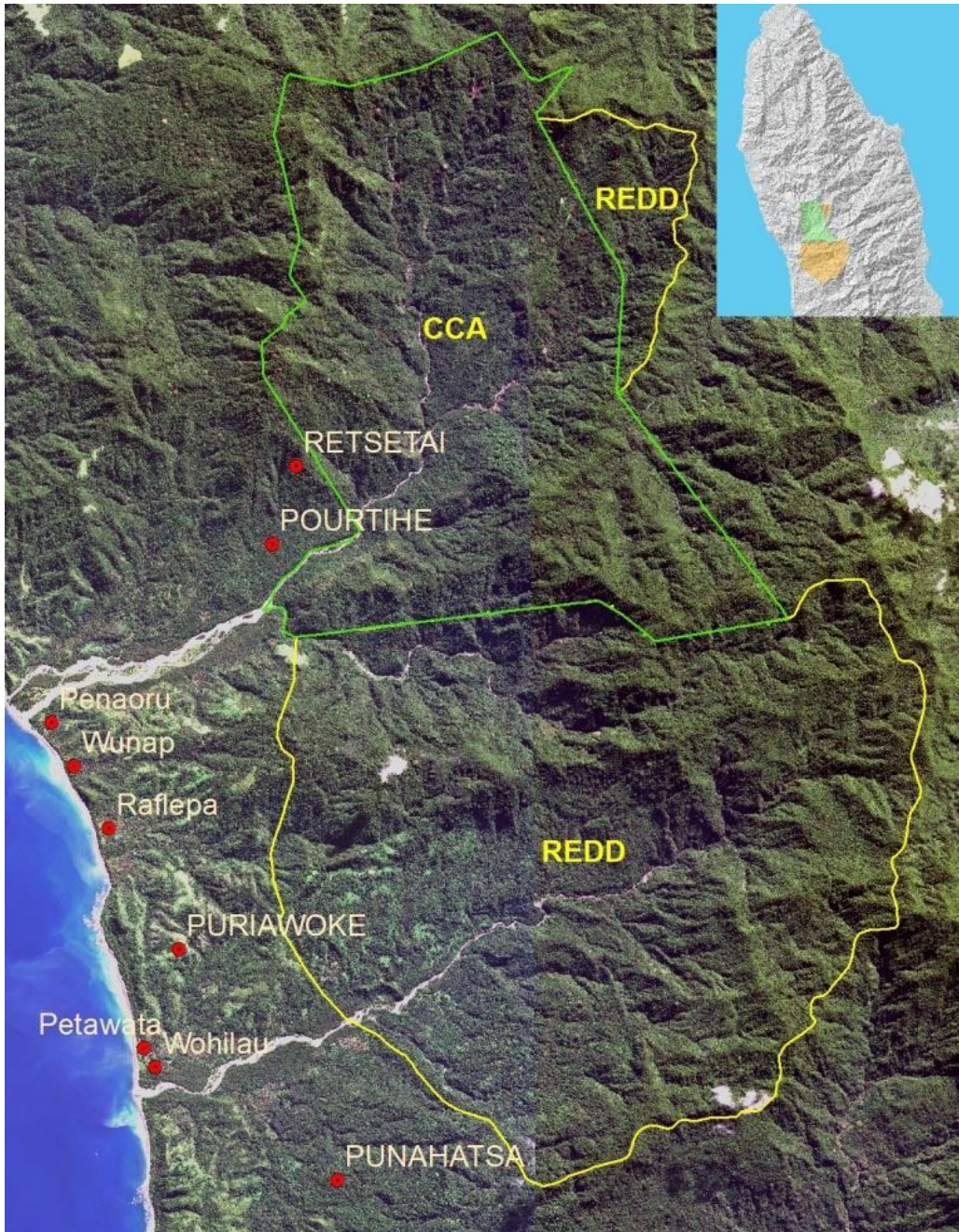
Figure 1: CCA/REDD+ Site Penaoru

Background: WorldView-2mosaic Band 5-3-2 (13.06./05.07.11)