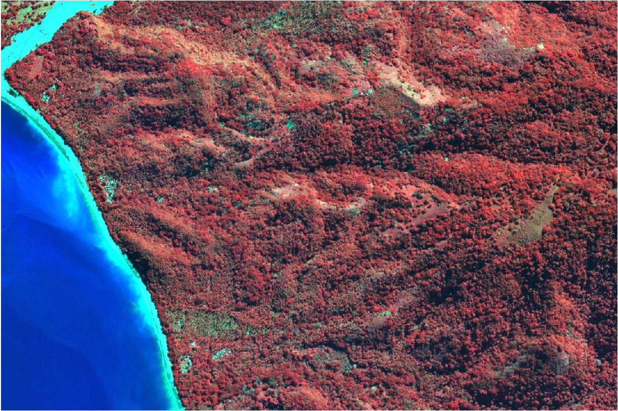
WorldView-2 image band 7-5-2 (13.06.2011)