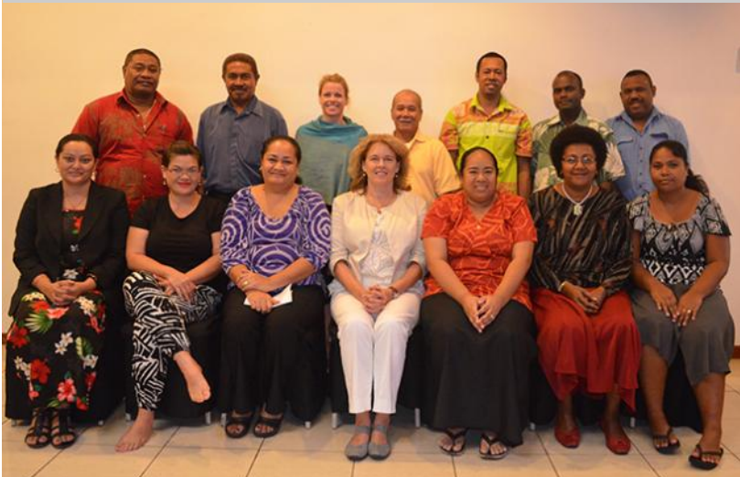
Photo: Participants at the final Multipartite Review (MPR) for the Pacific Islands Greenhouse Gas Abatement through Renewable Energy Project (PIGGAREP) in Nadi, Fiji.

SPREP's groundbreaking draft report on current and projected greenhouse gas emission reductions in the Pacific region has been commended by a gathering of renewable energy experts in Nadi.