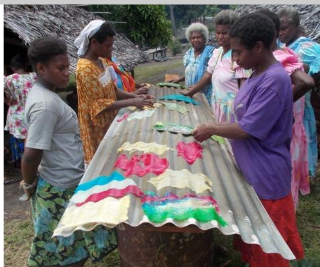
Photo: Tanna women drying manioc

The workshop was facilitated by the SPC-GIZ Climate Change program with the support of the Vanuatu Government.