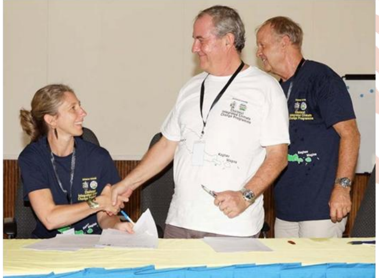
Handshakes upon signing of agreement

The Choiseul Integrated Climate Change Programme partners are: Secretariat of the Pacific Community; Secretariat of the Pacific Regional Environment Programme; Deutsche Gesellschaft Für Internationale Zusammenarbeit (GIZ); Pacific-Australia Climate Change Science and Adaptation Planning Programme; The Nature Conservancy, and the United Nations Development Program.