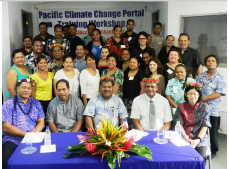
Photo: Participants and officials in FSM

The Pacific Climate Change Portal is an online platform designed to enable Pacific island nations to take responsibility for regional information sharing into their own hands. Once trained, in-country personnel will receive administrative access, enabling them to upload information directly on to the portal.