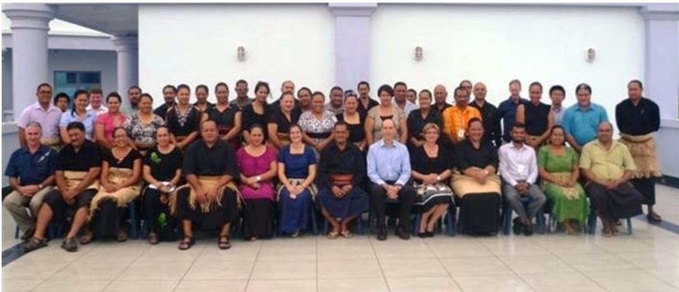
Participants at the Project Inception Meeting, Nukualofa, Tonga.