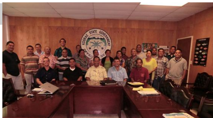
Photo: Workshop trainers and participants in Kosrae, Federated States of Micronesia