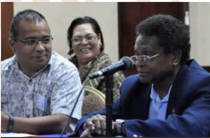
Photo: Negotiation training session