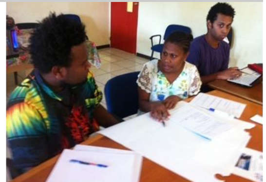
Photo: Participants in Vanuatu