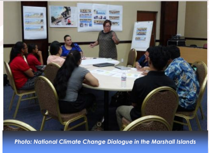
National Climate Change Dialogue in the Marshall Islands