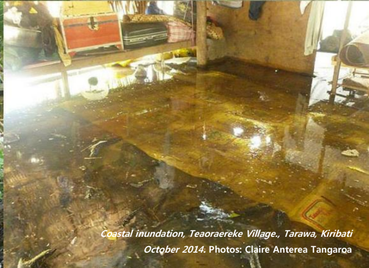
Coastal inundation, Teaoaraereke Village., Tarawa, Kiribati October 2014.