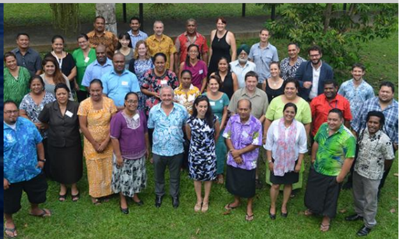
Photo: Participants at the training