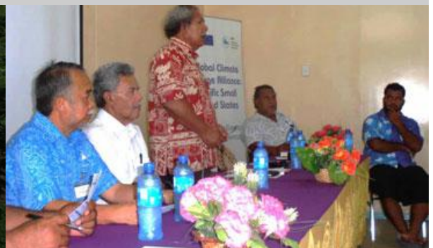
Photo: The training session in Tuvalu