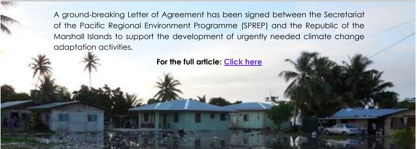
Photo: King tide inundation in the Republic of the Marshall Islands