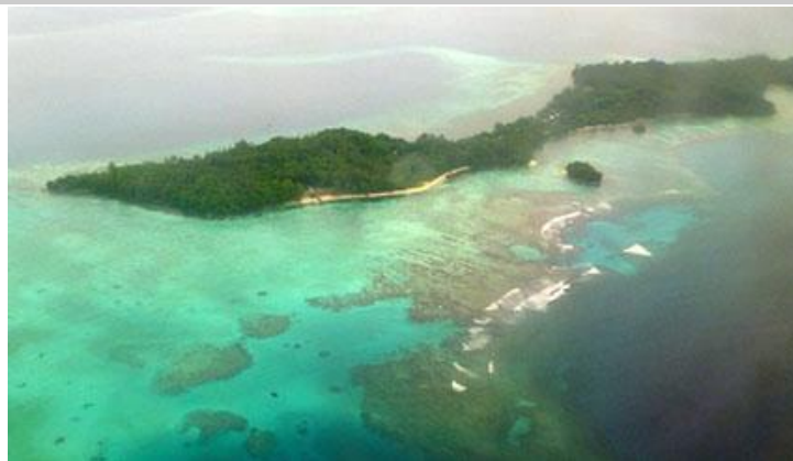
Western Province, Solomon Islands

Mark Brown, Minister of Finance for the Cook Islands attended as a key note speaker and shared with the conference the unique challenges faced by Pacific Small Island Developing States. He stressing that in order for climate finance to work in the Pacific region, it has to be accessible, simple and country driven ideally build upon proven and existing in-country structures.