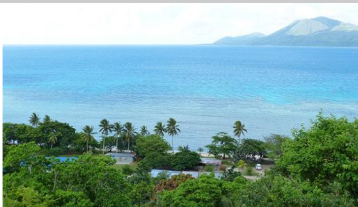
Siviri village in Vanuatu

The Coastal Ecosystem based Adaptation (EbA) to Climate Change project is implemented by the Vanuatu Department of Fisheries with technical assistance from SPREP and funded by the AusAID International Climate Change Adaptation Initiative (ICCAI).