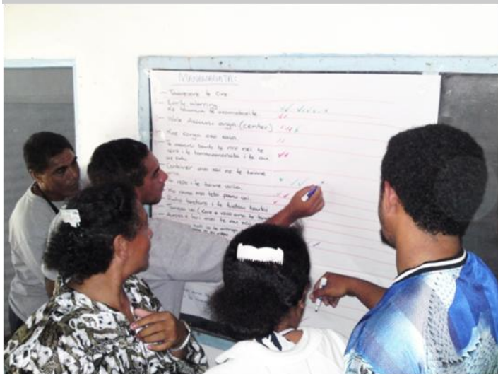
Community representatives discussing climate change adaptation in the Cook Islands

Cook Islanders living on low-lying atolls are receiving on-the-ground climate change adaptation assistance from the European Union (EU) worth Euro 0.5 million (approx. NZD 0.8 million) over two years.