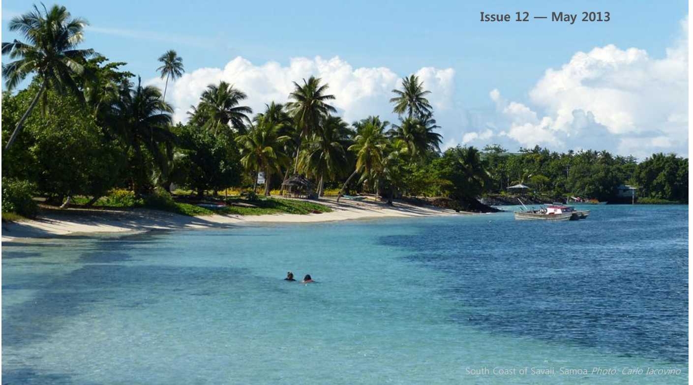
South Coast of Savaii, Samoa.