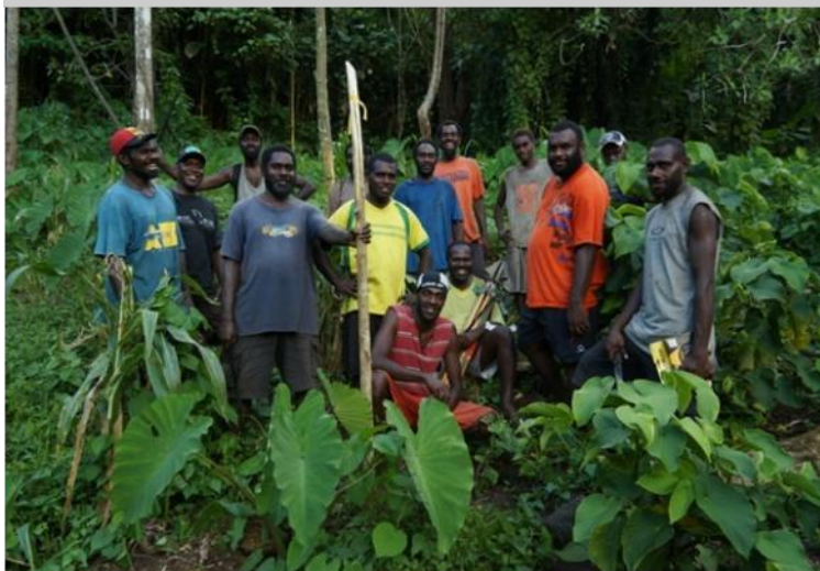
VARSU Tribesmen & the PACC survey team 'half-way'

Following a successful Participatory 3-D model consultation, the PACC team selected VARSU area to commence the road relocation project. A fortnight later physical work to map out the new road took place on Apr 16th 2013 .