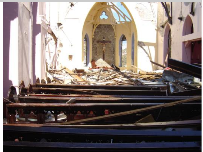
Damage to a church in Grenada, Cyclone Ivan, 2004.

It is apparent that there is a lot of sympathy for the situation of those countries who have done the least to cause climate change, but who are going to experience the greatest impacts, even loss of country and sovereignty in some cases. There was broad support for implementing risk management measures and to assist in enhancing systems to adapt to impacts.