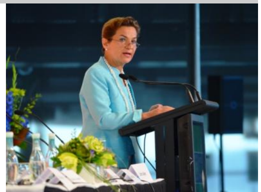
Christiana Figueres, the Executive Secretary of the United Nations Framework Convention on Climate Change