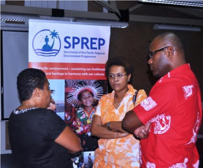
Photo: workshop participants discussing climate change and the media

Fiji's Ministry of Foreign Affairs through its Climate Change Unit has sought the assistance of the media to educate Fijians on climate change issues. At a two-day media climate change workshop, Permanent Secretary, Amena Yauvoli, said the Fijian Government had developed a National Climate Change Policy.