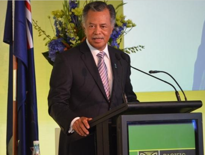
Hon. Henry Puna, Prime Minister of the Cook Islands

The Cook Islands Prime Minister Hon. Henry Puna has called for a stronger, unified effort by the Pacific to break its dependency on fossil fuels.