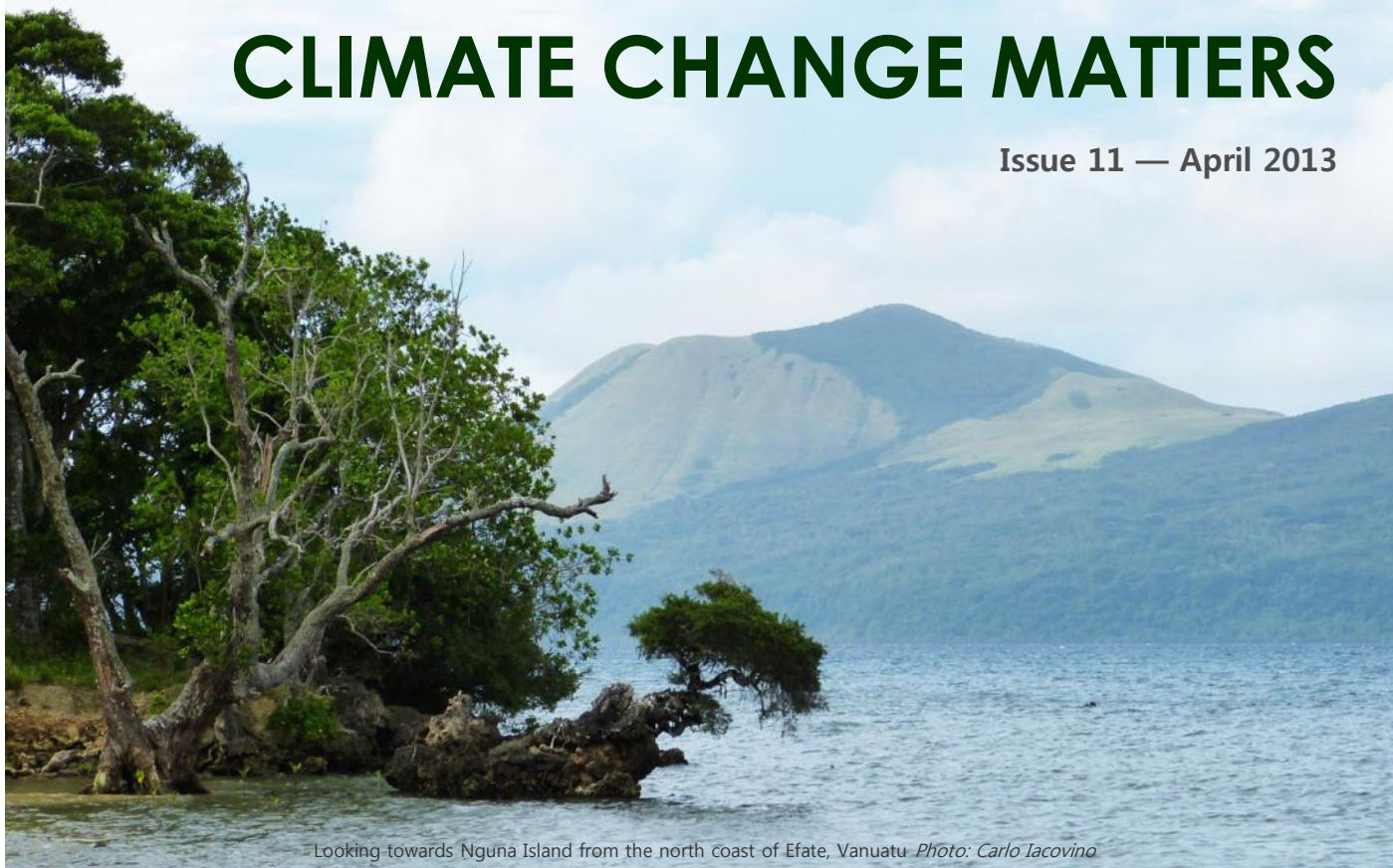
Looking towards Nguna Island from the north coast of Efate, Vanuatu