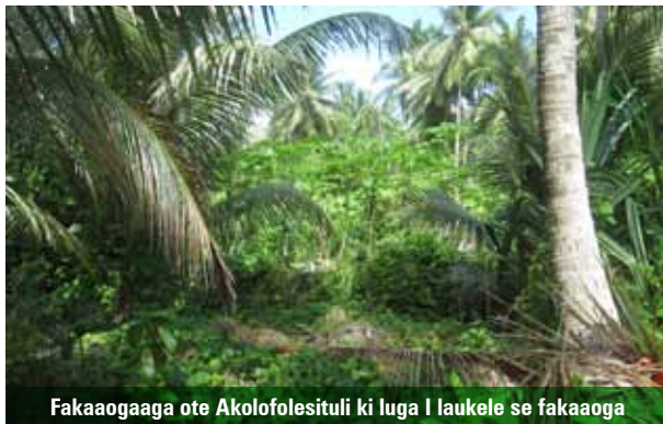
Fakaaogaaga ote Akolofolesituli ki luga l laukele se fakaaoga