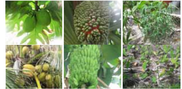
Lakau kaina faka matea kae aofia l loto ite Akolofolesituli