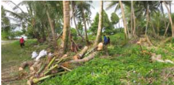
Velega mote tokiga o lakau kaina faka Akolofolesituli